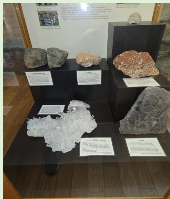
Display at the Arkansas Welcome Center on I-70

This is a novel use of rocks that is on display at the Joseph Allen Skinner Museum in South Hadley Massachusetts. Below is the picture of the typewriter that the sign above refers to. If you choose to use this in the newsletter, you are welcome to.