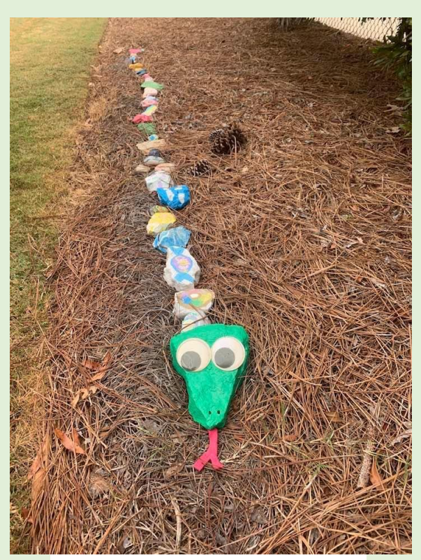
"Rock Snake -- add your own rock"