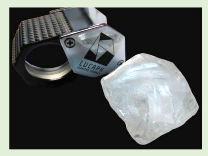
The 208-carat diamond recovered at Lulo mine. ( Image courtesy of <u>Lucapa Diamond</u>. )

https://www.mining.com/lucapa-finds-lulomines-third-largest-diamond/