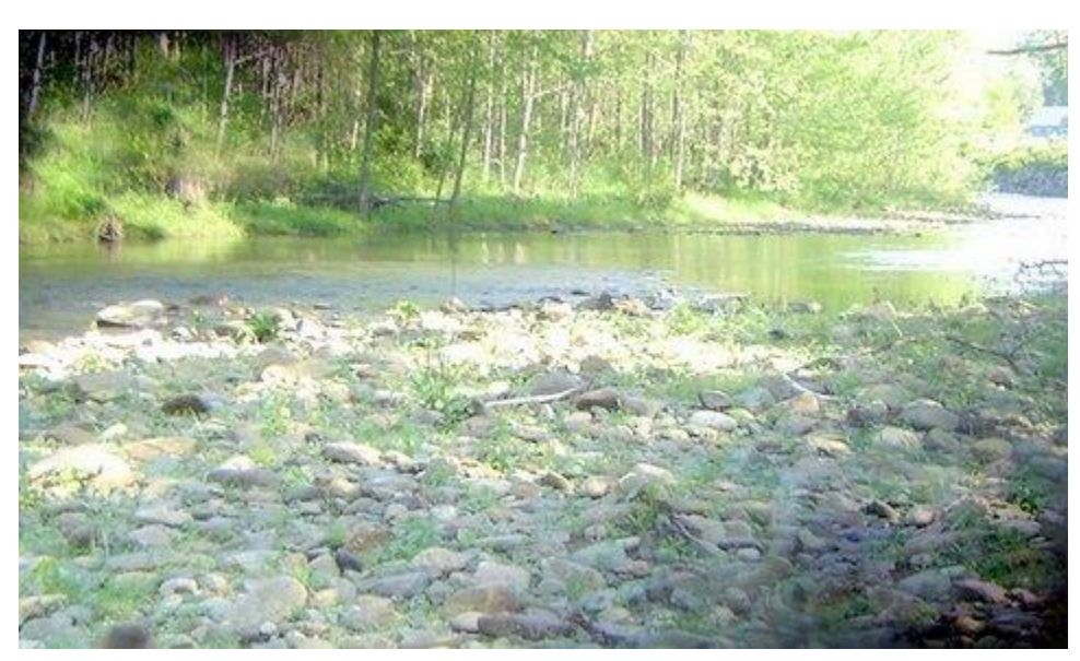
And wouldn't you know, it landed right on top of a gravel bar.

The little rock fairy remembered lots of floods, but the flood on June 27, 1995 was a real doozy. It rained over 30 inches in just a single day. The little rock fairy overheard people say that flood was a 500 or a 1,000 year event --- which meant that it only happened once every 500 or more years. Well, that flood certainly changed everything for the little rock fairy because it was swept completely out of the Rose River into the Robinson River.