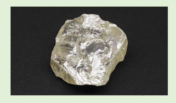
Figure 1. The 187.63 ct Foxfire rough diamond.

Gems & Gemology, Winter 2017, Vol. 53, No. 4