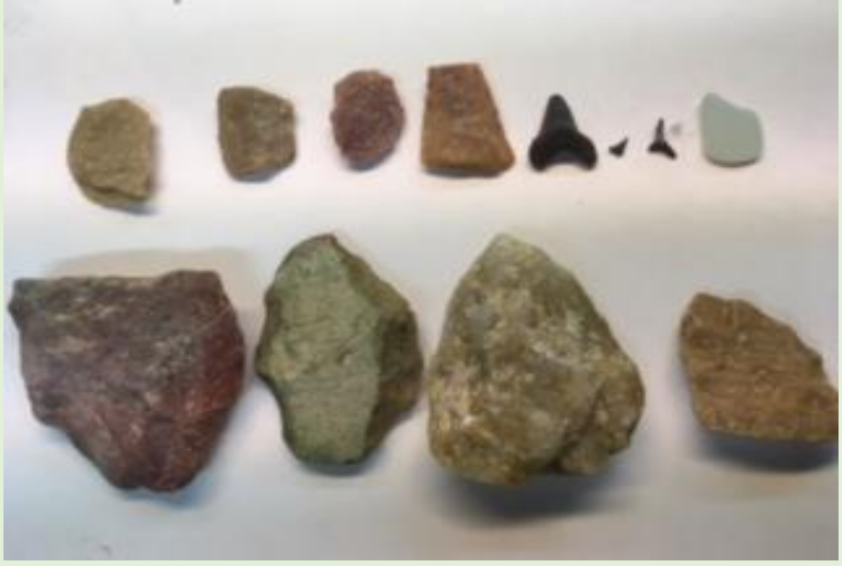
Page 11 of 13