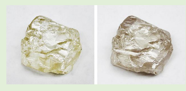
Figure 2. Left: The Foxfire diamond, photographed in daylight-equivalent lighting. Center: The fluorescence exhibited in a darkened room while the diamond was exposed to longwave UV. Right: The phosphorescence shown in a darkened room immediately after extinguishing long-wave UV excitation.

Exposing this stone to the near-band-gap ultraviolet light of the DiamondView instrument (about 210 nm) and short-wave UV (253.7 nm) results in only very weak fluorescence and phosphorescence, as reported earlier. However, exposure to mid- and long-wave UV (313 nm and 365.0 nm, respectively) produces extremely strong blue fluorescence and strong, long-lived orangish phosphorescence (figure 2).