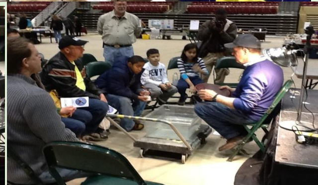
February 2015 - SMRMC Rock Show , Upper Marlboro, MD