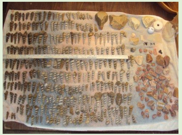
Member's Finds (Photos and Article by Dave Lines)

These are my finds for February 29, 2020 (Sadie Hawkins Day!!) Saturday afternoon's blowout tide at Purse State Park (now named "NanjemoyWildlife Management Area") in western Charles County, MD. I arrived at about 2:00 pm at the parking lot --- wind was howling from the NW and cold. I bundled up and headed to the beach. Predicted low tide was about 4:00 pm, but it was already w-a-a-ay out --- at least 1-1/2 feet below normal low tide and least 10 to 20 feet of extra beach showing. Lots of rocks were sticking up -- a good sign. A fellow from Virginia was already looking and he had found about 20 small teeth. I quickly walked well past him --- at least a mile down the beach. There was lots of fallen trees down with lots of fallen cliff sections on the beach. A lot of obstacles to get past. If the tide had been normal level, I definitely would not have been able to get past all the downed trees. The beach past the first major point was in excellent condition --- no seaweed -- just gravel and big rocks -- with some sections of sand. I found a good deal of turritella fossils that had been released from the fallen cliff sections by freezing and thawing.