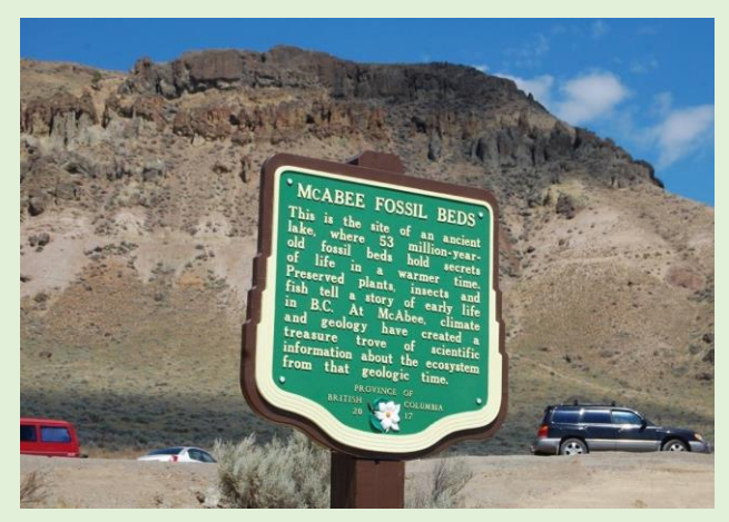
A new "Stop of Interest" sign has been erected at the McAbee site.