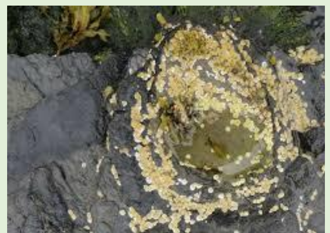
Deltapodus prints offering the first strong evidence that stegosaurian dinosaurs were part of the Middle Jurassic landscape on Skye

Two sites preserve around 50 footprints, a discovery that highlights the richness of prehistoric life on the island