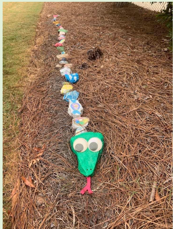
"Rock Snake -- add your own rock"