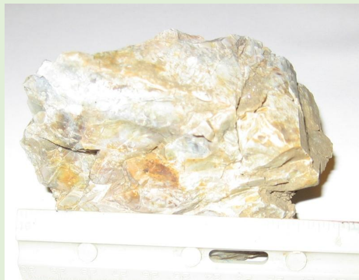
Figure 3. Flint Ridge flint.