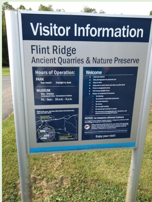
Flint Ridge Ancient Quarries and Nature Preserve