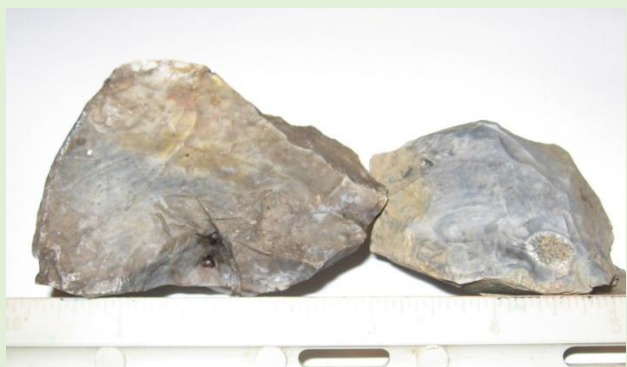
Figure 1. Flint specimens. The one on the right shows the crystal lined vug.

along the road to see what we could find. We found some nice examples of flint. Each of us collected about a dozen samples of various sizes. One of Mary's specimens had quartz points on one side. Two of Ralph's specimens had crystal lined vugs. Figure 1 shows the specimen with a ½ inch vug. Figures 2 and 3 show more specimens of Flint Ridge flint. Figure 4 shows heat treated flint. The heat treatment brought out the colors of the flint. Yes, we did have a "Yabba Dabba Doo" time collecting flint.