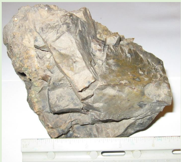
Figure 2. Flint Ridge flint.