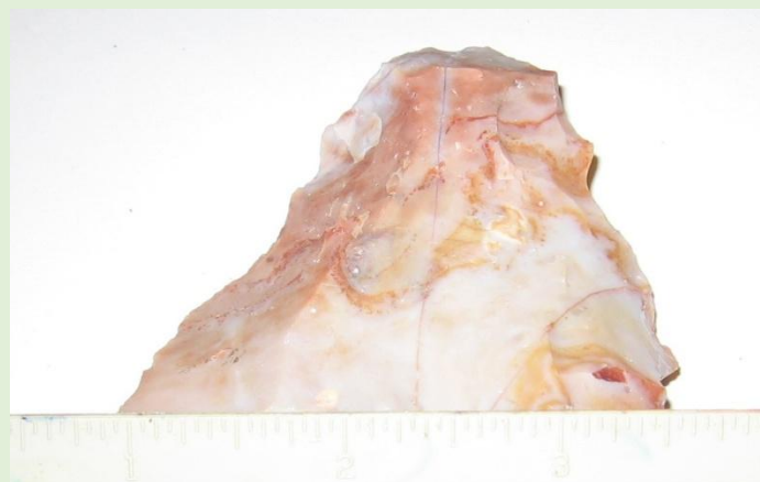
Figure 4. Heat treated flint.