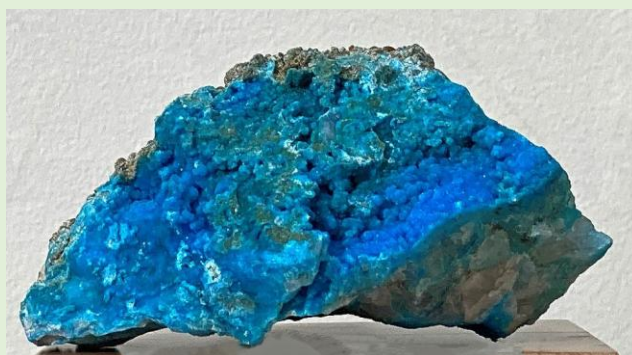
Turquoise. Lynch Station, Virginia. FOV ~10 cm. JMU specimen.