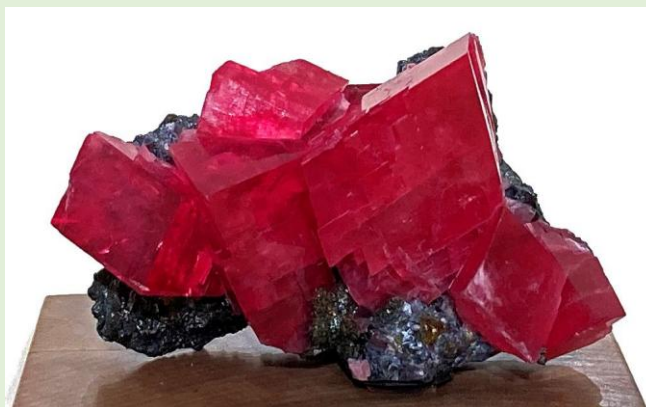
Rhodochrosite. Sweet Home Mine, Alma, Colorado. FOV 12 cm. JMU specimen.