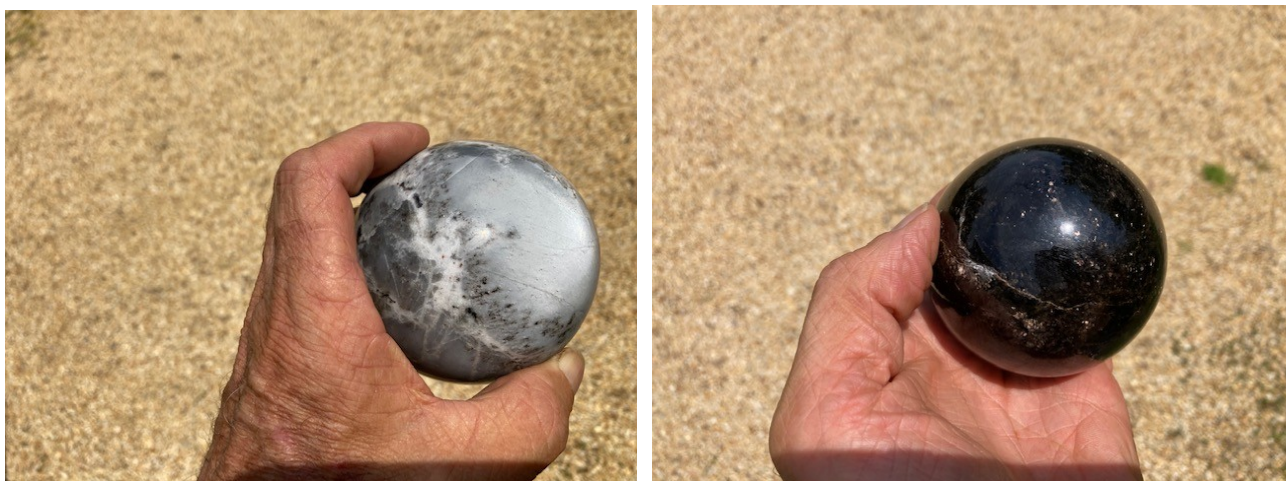
Polished spheres from material found previously at US Silica