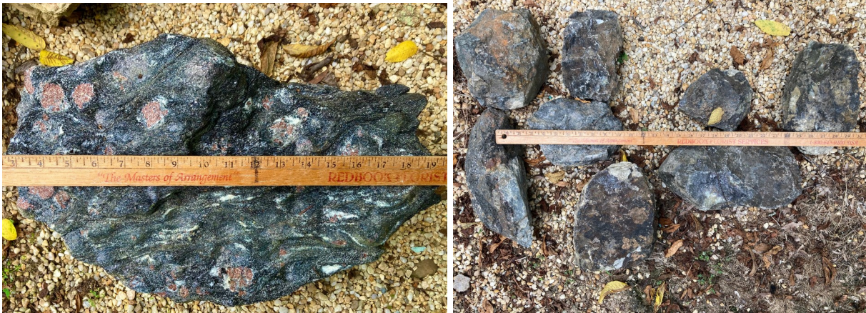
Great yard rock full of garnets

We also found nice specimens of silver flash moonstone and a few pieces of white flash moonstone that were otherwise translucent. Some folks found more ilmenite including some that showed iridescence (rainbow colors). We also found a good bit of very solid, massive blue quartz. Some of it was in the form of relatively narrow bands of blue quartz in albite and one large very homogenous chunk which was in the quarry floor that proved too tough to easily extract with our tools within the time remaining. Rich also found a promising two-inch-thick vein of clear, lightly smoky colored quartz embedded in clay, but he decided to abandon after following it for a while without any signs of crystals.