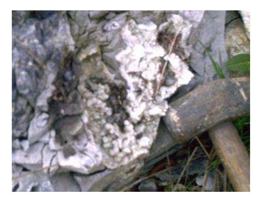
Figure 3. Geode in Chert

Our first stop was in the back of an old strip mall, near the Alfa Insurance and Sears building. The temperature was in the low 60s, making a great day for collecting. In the back was a 15 foot bank which contained limestone, chert, druzy quartz and geodes. Collecting was easy except for extracting the geodes from the chert. The geodes were thin walled so we could only obtain pieces of the geodes. Figure 3 shows a typical geode in the chert.