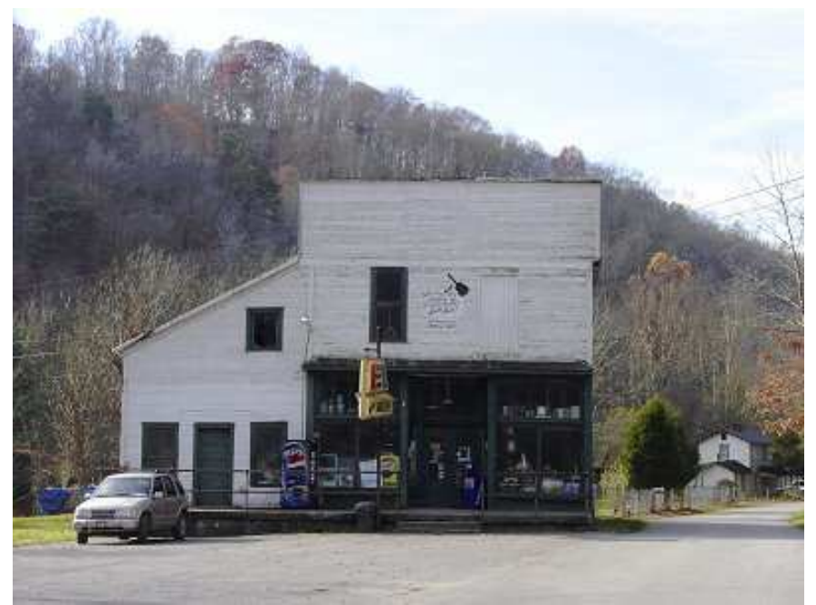
Figure 8. Webb Grocery Store

We drove by the homestead on Butcher Hollow Road. The road barely had room for one car, although it was paved. On the way, we passed homes that had collapsed and many homes in need of upkeep. It is a poor community.