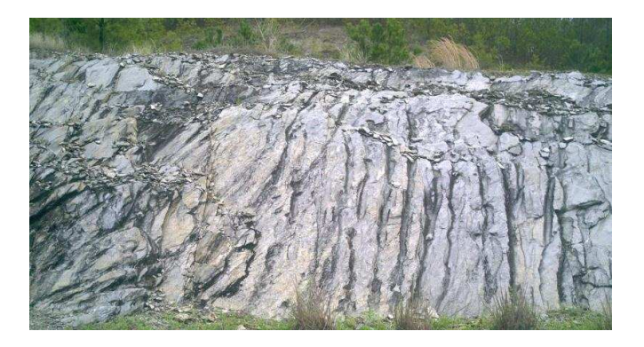
Figure 1. Exposed schist at Wetumpka

The hills east of downtown Wetumpka Alabama are part of the eroded remains of a five mile meteor crater. The impact occurred about 83 million years ago. In the circular pattern that makes up the rim of the crater, the hard rocks of the Piedmont are bent sharply upward and point toward the center of the impact. Figure 1 shows a portion of the rim where the underlying schist exposed. The normally horizontal layers of more recent surface rocks are mixed in and around the crater. Normally the sedimentary rocks of the Costal Plain overlap the older and harder metamorphic rocks of the Piedmont. But at Wetumpka, rocks of more than two hundred million years different of age are intermixed. Below the surface, concentric rings of fractures and zones of shattered rock encircle the area.