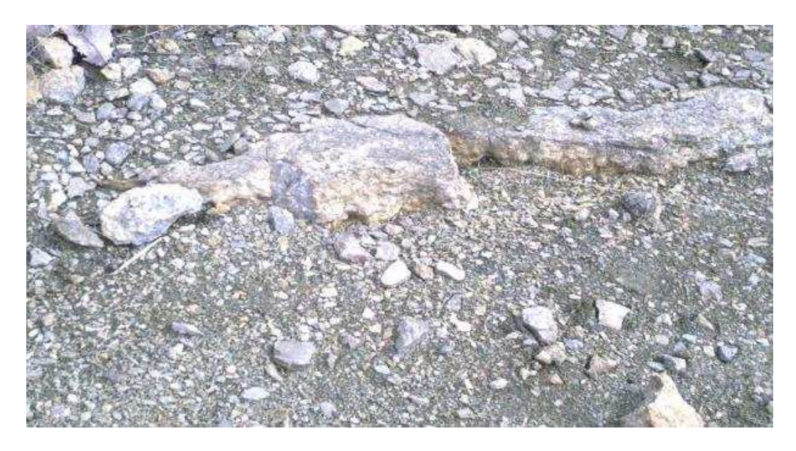
Figure 5. Fossils in Fort Payne