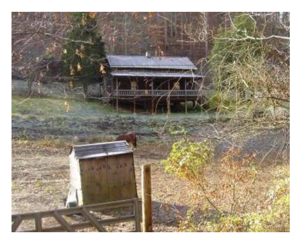
Figure 7. The Webb Homestead in Van Lear