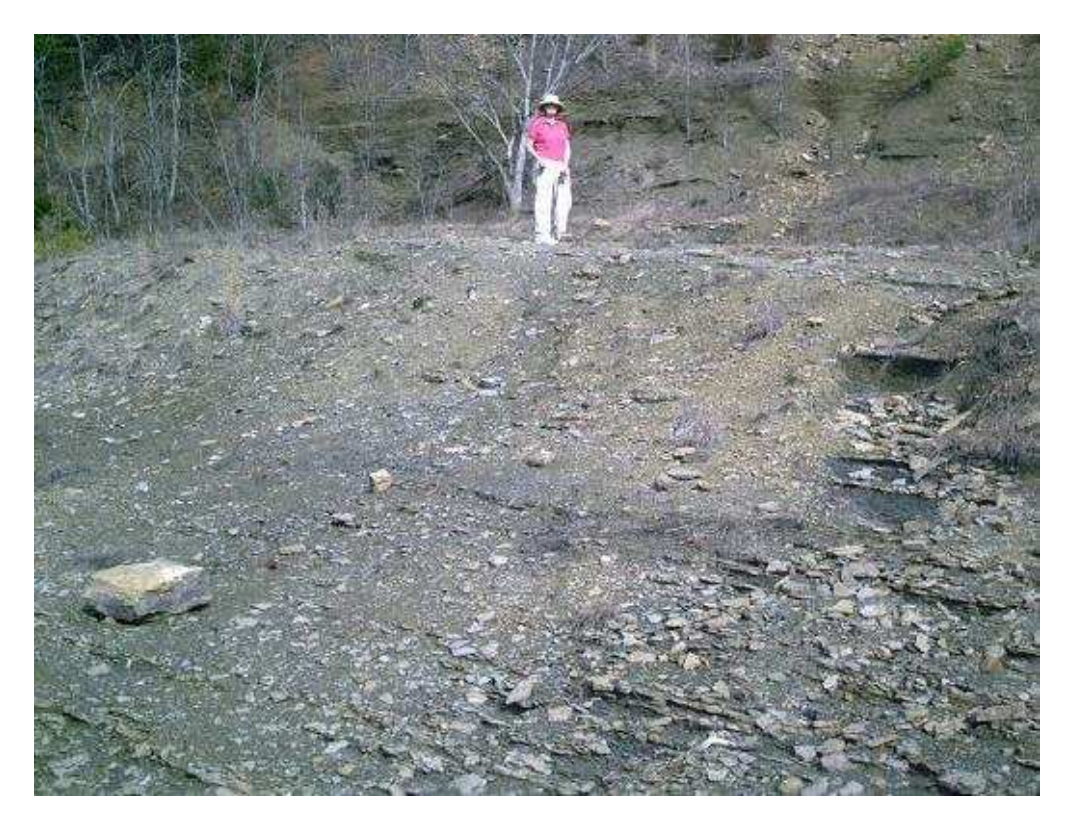
Figure 4. Fort Payne Fossil Area

We checked out the chert quarries cited in the article, but decided that we had enough chert, so we didn't collect. One quarry looked like it was still active.