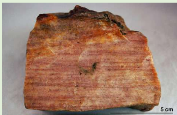
Quartzite: the ideal gravestone material. ERIK KLEMETTI

sphene that can take a beating and persist. That's why when you look at sand under a microscope, you might see a lot of these minerals — and why the oldest stuff on Earth is zircon (the ~4.4 billion year old zircon of the Jack Hills, themselves "gravestones" of rocks that came before them). However, making a gravestone out of these minerals might mean a very, very small marker.