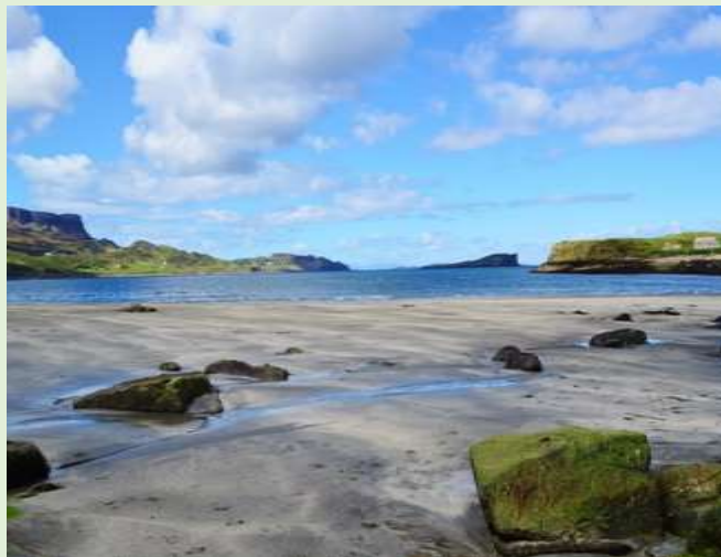
Staffin Beach. Beautiful even when the tide is in

At low tide on Staffin Beach on the Isle of Skye you can literally walk in the footsteps of dinosaurs when the receding sea reveals prints left by tiny dinosaurs 165 million years ago. Should you miss the tide, the Staffin Museum nearby has casts of the prints, as well as dinosaur bones and other fossils from the areas as well.