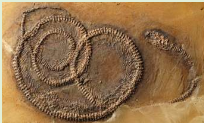
Fossil food chain

Tucked away in the Odenwald region near Frankfurt , the Messel Fossil Pit is a rare window into the Eocene period and, in particular, the evolution of mammals. Once a volcanic lake surrounded by tropical forest, the oil shale here has revealed such a host of prehistoric treasures that it has been declared a UNESCO world heritage site.