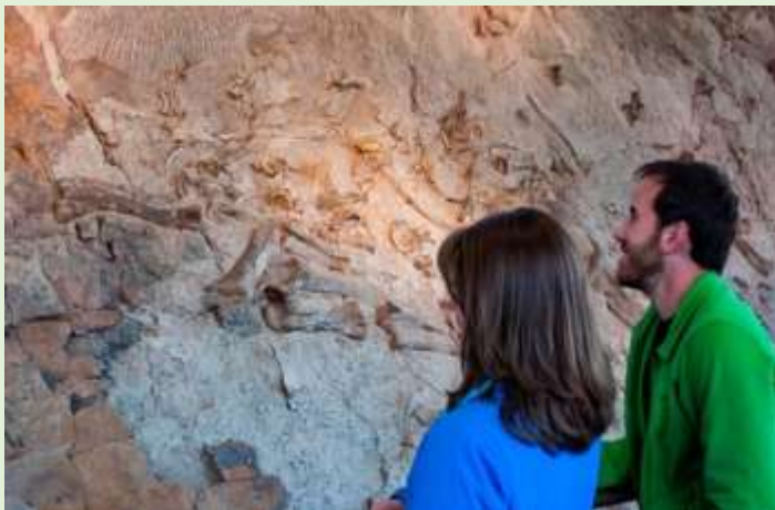
Admiring the Wall of Bones (NPS)

Millions of years ago, when the USA's southwest was not as dry and inhospitable as it is now, a sandbank at the point where the Green and Yampa rivers meet became something of a dinosaur graveyard. Carcasses of dinosaurs from all along the rivers washed up and got stuck here, preserved for all eternity when the sandbar turned to rock. That 'Wall of Bones', a tilted layer of rock containing over 1,500 dinosaur fossils, can be viewed at the Quarry Exhibit Hall in the Dinosaur National Monument on the Utah/Colorado border.