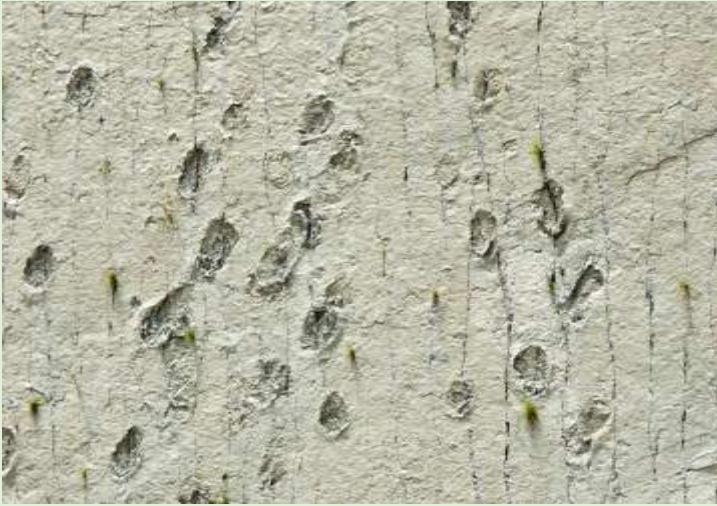
Dinosaur tracks leading up a wall in Cal Orcko

Scientists believe the footprints were made by a baby T.Rex, flanked each side by its parents. They hadn't defied gravity. The muck in which they walked solidified and went vertical when plates deep beneath the earth crashed together. At the top of the cliff, you'll find the Cretaceous Museum, home to 24 life-sized dinosaur models and a viewing platform that reveals the sheer magnitude of the world's largest collection of dinosaur footprints.