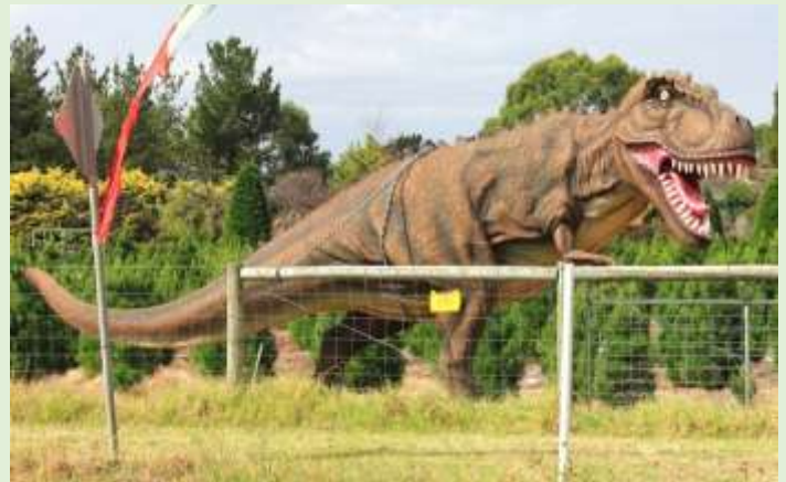
Dinosaur chained to a fence in Australia (Dreamstime)

Billing itself as Australia's premier marine fossil museum, Kronosaurus Korner is a popular stop on Australia's Dinosaur Trail in western Queensland. Here you'll find 'Penny' the Richmond plesiosaur (Australia's best vertebrate fossil), 'Krono' Kronosaurus queenslandicus (a 10-metre, giant marine reptile) and 'Wanda', Australia's largest fossilised fish.