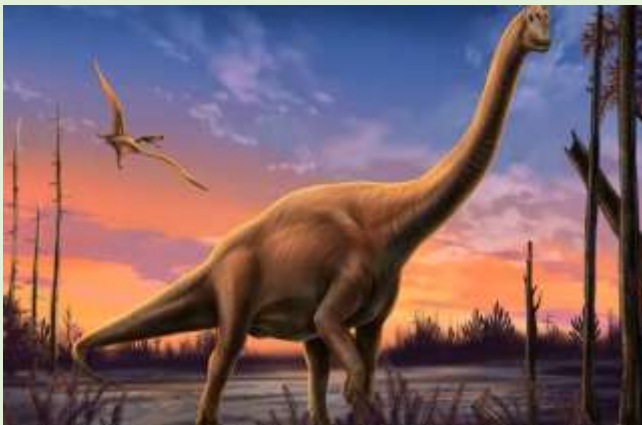
A brachiosaurus visiting Barcelona millions of years ago

Dotted at sites across the world, dinosaur footprints are relatively a dime a dozen. A recent geological survey in the village of Vallcebre near Barcelona, however, found the impression of a dinosaur's scales, formed 66 million years ago when it lay down in the mud.