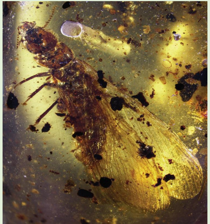
A reproductive termite Krishnatermes yoddha is in amber.

Advanced sociality, or eusociality, a hallmark of which is reproductive specialization into worker and queen castes, is essentially a phenomenon of the group of invertebrates known as arthropods. Queens and reproductive males take the roles as the sole reproducers while the soldiers and workers defend and care for the colony. Eusociality occurs in a range of arthropods, from some shrimp, beetles, and aphids, to various wasps, though the phenomenon is nowhere more pronounced than in honey bees, ants, and termites. (Among vertebrates, eusociality is found in just two species of African mole rats.)