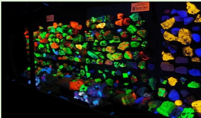
Minerals are seen at the Ben E. Clement Mineral Museum in Marion, Ky.