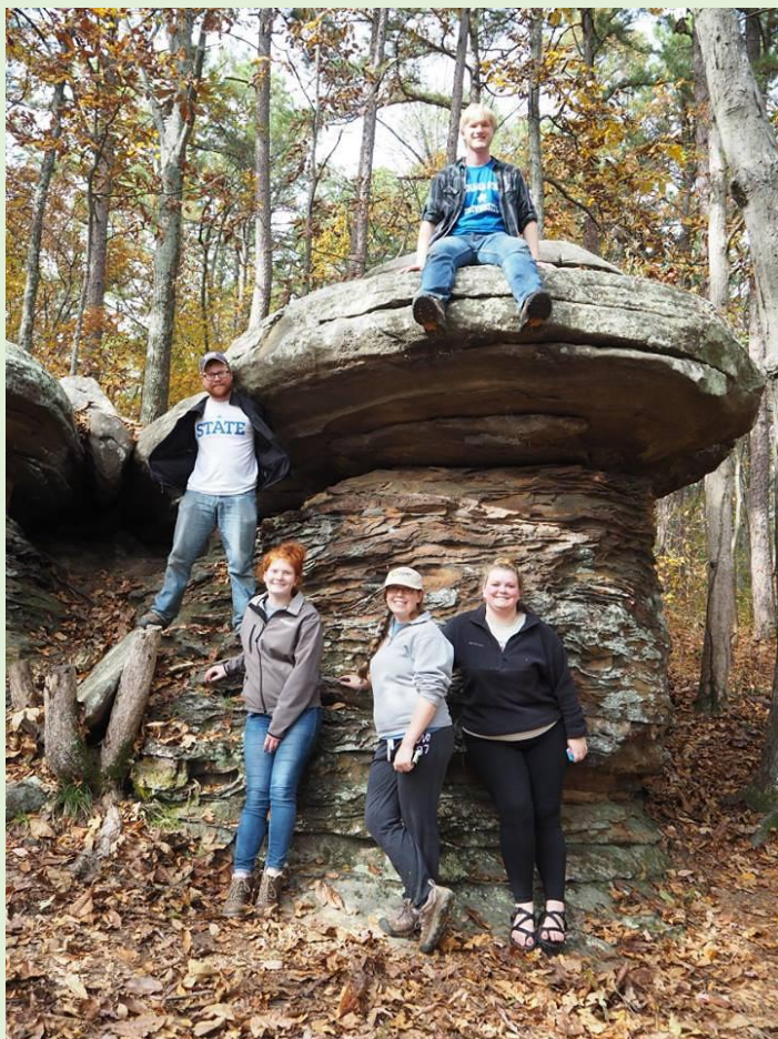
Indiana State University students pose at the Garden of the Gods in Shawnee National Forest during a recent trip.

http://www2.indstate.edu/news/news.php?newsid=4620 Indiana State University Newsroom