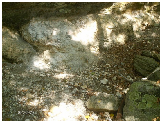
Figure 2. Case Quarry