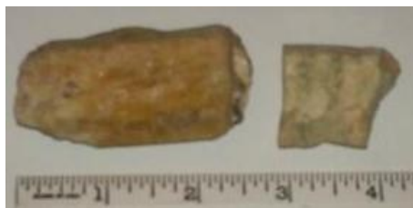
Figure 7. Beryl from the State Forest Quarry

We had a great time collecting at the Quarries. Case Quarry does still have beryl, but they are small. The Nathan Hall Quarry has plenty of schorl for the collecting. We would recommend visiting the Nathan Hall Quarry and State Hall Quarry #1 first if you only have time to collect at one place.