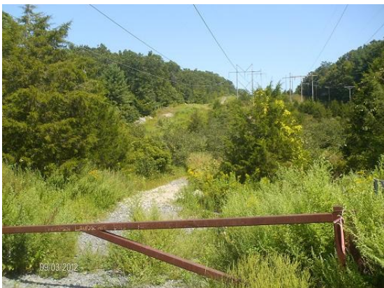
Figure 1. Path to Case Quarry