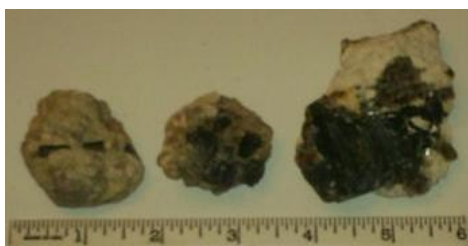
Figure 6. Schorl from Hall Quarry

On September 9, we visited the Northern Berkshire Mineral Club rock show. One vendor had Connecticut minerals from an old collection. We obtained beryl, both yellow and blue from the State Forest Quarry, Figure 7. We also obtained a clear, gemmy sample of an unknown from the State Forest Quarry. The sample is harder than quartz. It could be clear beryl (goshenite) or topaz. In addition, we obtained a sample from the Strickland Quarry in Portland, CT, now an 18 hole golf course 5 . The sample had whitish beryl in albite. The albite was the variety cleavelandite, more like the samples from the Walden Gem Mine. The vendor had a sample of blue – green cleavelandite, very similar to the cleavelandite at Morefield. We purchased a sample of amazonite and a beryl crystal from Blandford, MA.