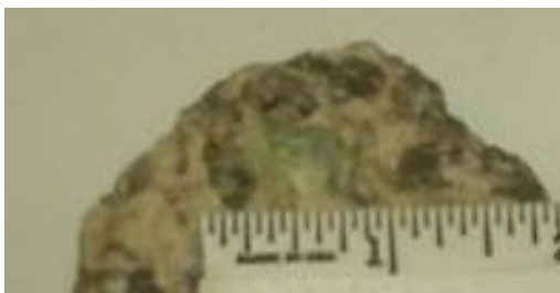
Figure 3. Beryl from Case Quarry