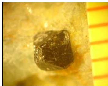
Microlite (2008) close-up Ruler tic marks are 1 mm

Microlite is named from Greek, mikros for "small" and lithos for "stone", alluding to the small size. It is a pale-yellow, reddish-brown, or black isometric mineral composed of sodium calcium tantalum oxide with a small amount of fluorine (\text{Na,Ca})_2\text{Ta}_2\text{O}_6(\text{O,OH,F}) . Rare earth elements may also occur in Microlite, often making it slightly radioactive. Microlite was first described in 1835 for an occurrence on the Island of Uto, State of Stockholm, Sweden . The type locality is the Clark Ledges pegmatite, Chesterfield, Hampshire County, Massachusetts .