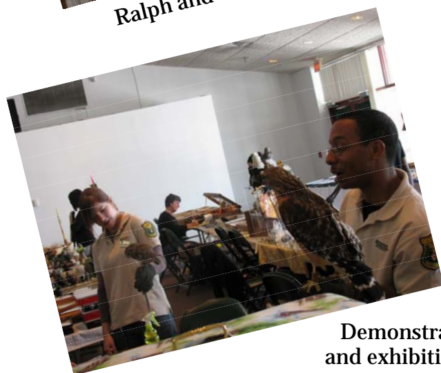
Demonstrations by members and exhibitions from the Nature Center were included also