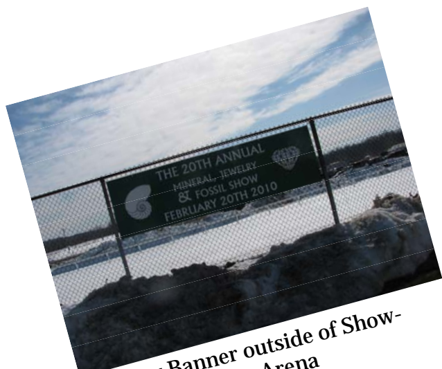
Show Banner outside of Showplace Arena