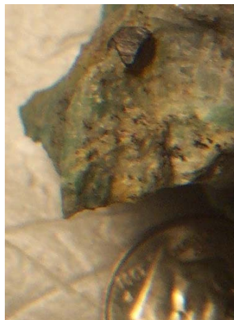
Microlite, Collected November 3 2007.