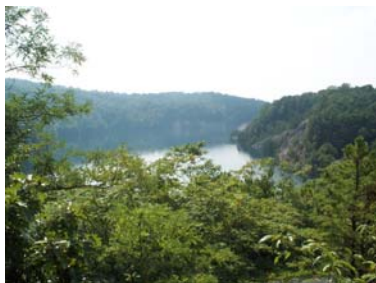
Figure 1. Hurricane Agnes flooded the pit in 1973.

Cornwall hosted iron mining beginning in 1742. Hurricane Agnes began to flood the mine in 1972 (Figure 1) and mining operations ceased in 1973. The three mine openings (big hill, middle hill and grassy hill) produced approximately 106 million tons 1 of iron ore and over 82 minerals, including gold 2 . Fluids from a diabase intrusive replaced limestone, forming magnetite and other minerals. The Pennsylvania Historical and Museum commission offer tours of the Cornwall Iron Furnace ( www.cornwalliornfurnace.org ).