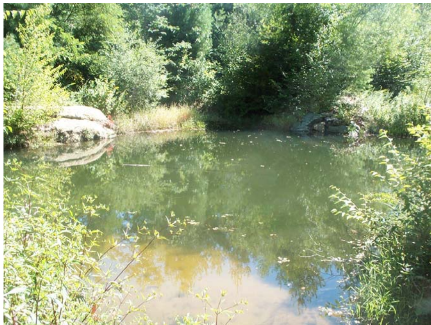
Crabtree Emerald Mine main shaft

After paying the fee and signing the release forms, we headed to the mine. We turned onto Emerald Mine Road, which quickly became a dirt road and then a stone-covered road. There was a small circle where we could pull off the road and park. We gathered our tools and started collecting. The wncrocks website has the history and a brief geology write-up of the mine.